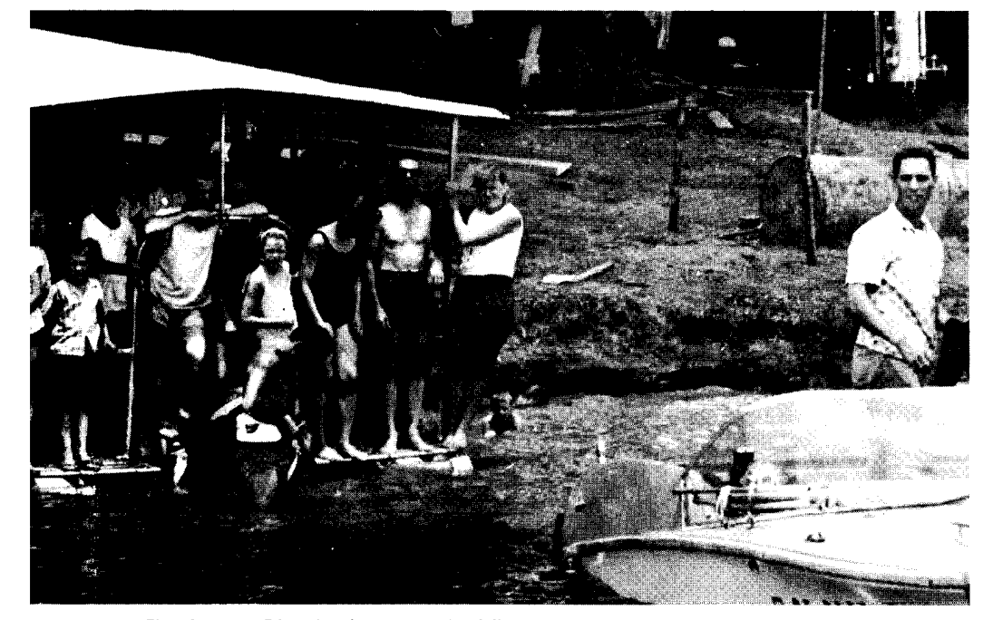
The Summer Educational Program in full swing! The children of many of God's People have the privilege to enjoy the time of their lives—as well as develop character this summer.

Perhaps the single most important activity in God's Work has been carried on behind the scenes. That activ-